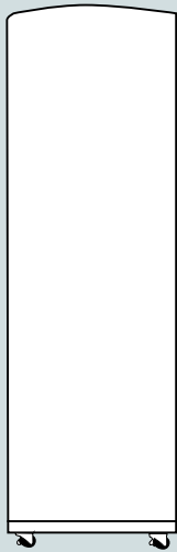
[ side view ]